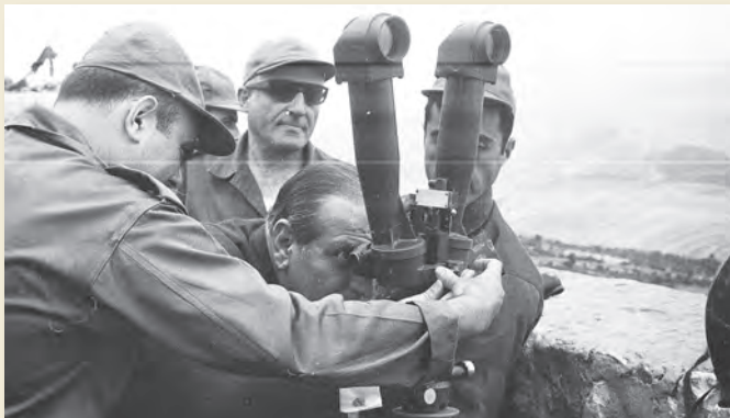
Tour of the President of the Republic Charles el-Helou in the south in 1970