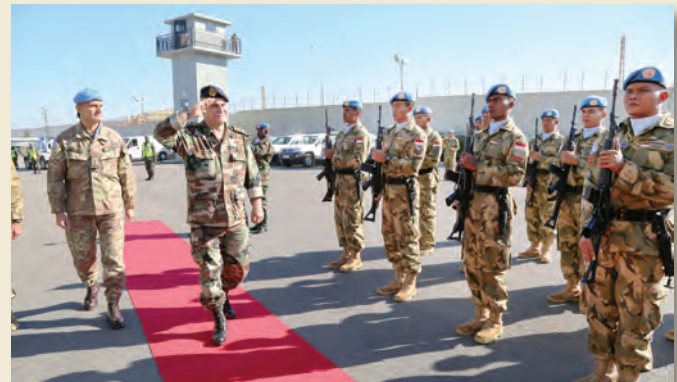
Tour of General Jean Kahwagi in the South on 23/12/2013