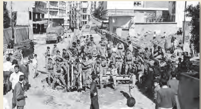
Building the Billy Bridge in the neighborhood of Kantari in 1966