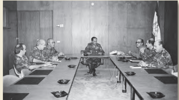
Meeting for the military council in 1984