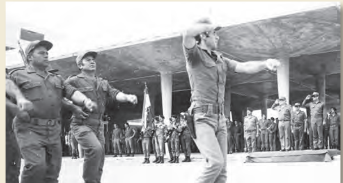
A military parade at the Ministry of National Defense – Yarzeh in 1979