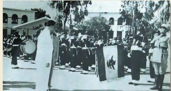
The President of the Lebanese Republic Fouad Chehab bowing before the Lebanese flag