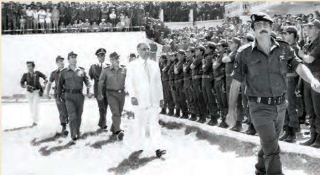
President Elias Sarkis during the Army Day celebration in 1979