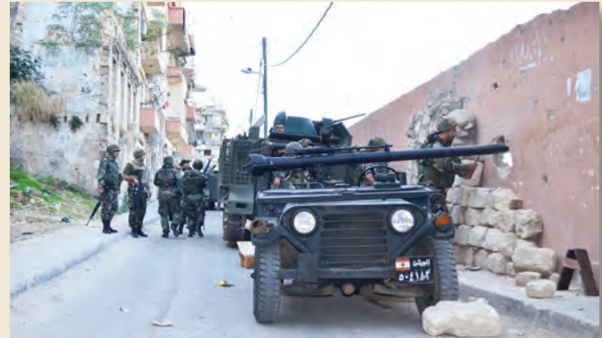
Tripoli security incidents in 2013