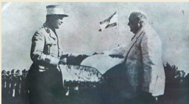
The President of the Lebanese Republic Sheikh Bechara el-Khoury handing over the Army flag to the Army Commander Major General Fouad Chehab in August 1945