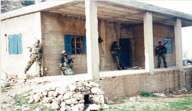
Donniye security incidents in 2000