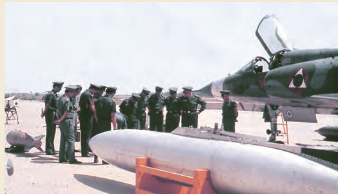
Visit of General Jean Njeim to Qoleyaat Airbase in 1970