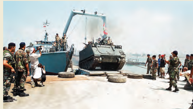
Deployment of the LAF in the South in 2006