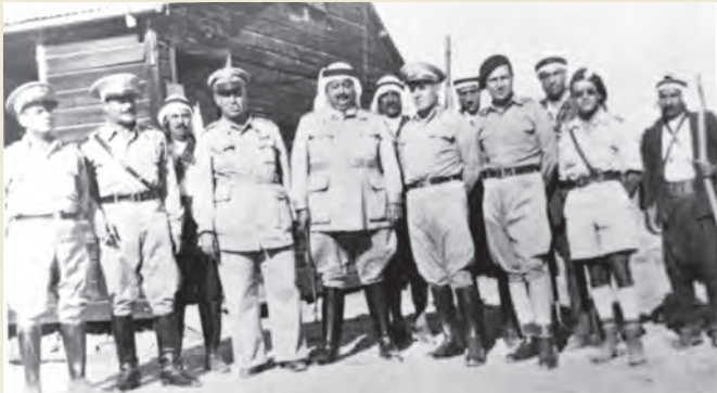
Minister of National Defense Emir Majid Erislan in Melkieh in 1948