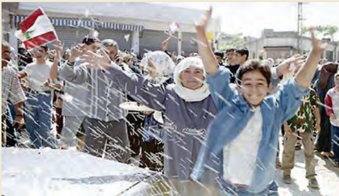
Liberation Day 2000