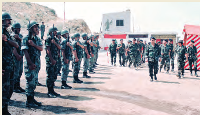
The tour of General Michel Aoun in Sannine and Ouyoun el-Siman in 1987