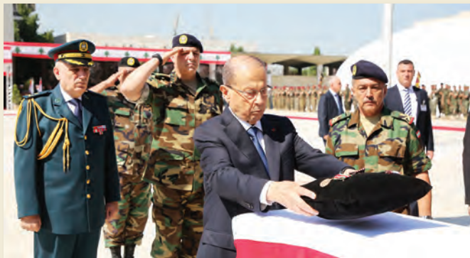
The honoring ceremony of kidnapped martyr troops during the Ersal security incidents at the Ministry of National Defense in 2017