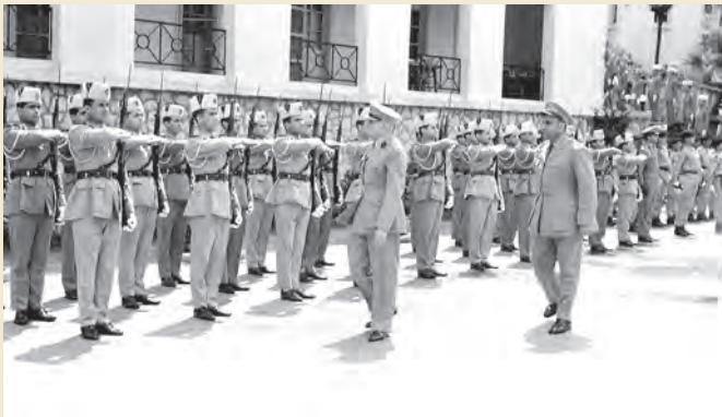
Tour of the Army Commander General Emile Boustany in the Military School on 4/5/1966