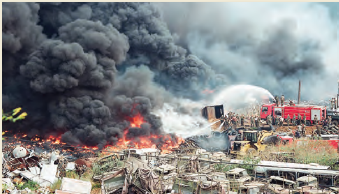
July assault in 2006