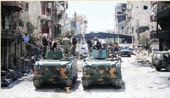
Abra security incidents in 2013