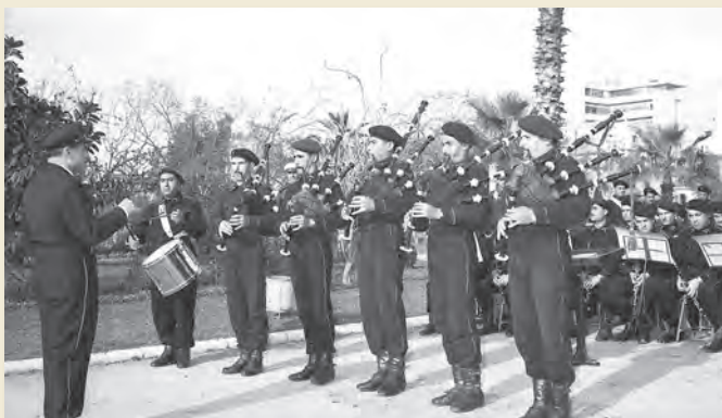
The Army Band in el-Sanayeh garden – Beirut in 1966