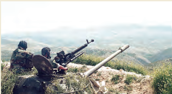
Grapes of Wrath in 1996