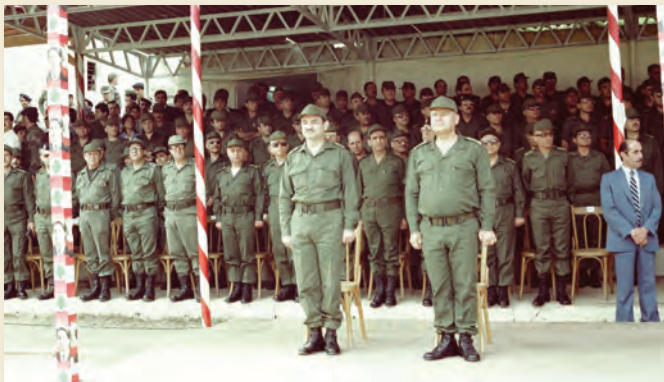
General Ibrahim Tannous during the sword distribution ceremony to the officers on 06/05/1983