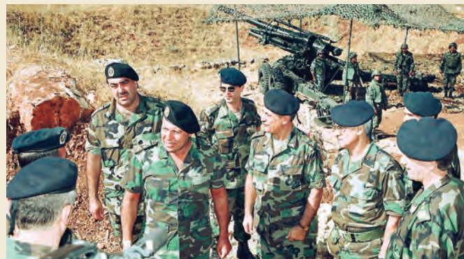
Tour of General Emile Lahoud in West Bekaa on 25/09/1997