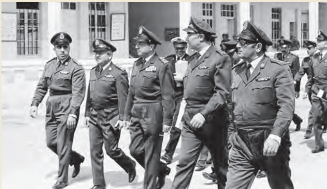
Visit of General Iskandar Ghanem to the North region in 1975