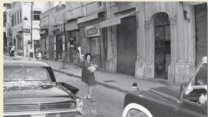
Visit of the President of the Lebanese Republic Fouad Chehab to Sin el-Fil in 1963