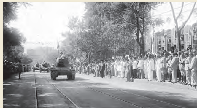
First military parade held in front of the Ministry of National Defense at Mathaf on 1/8/1945