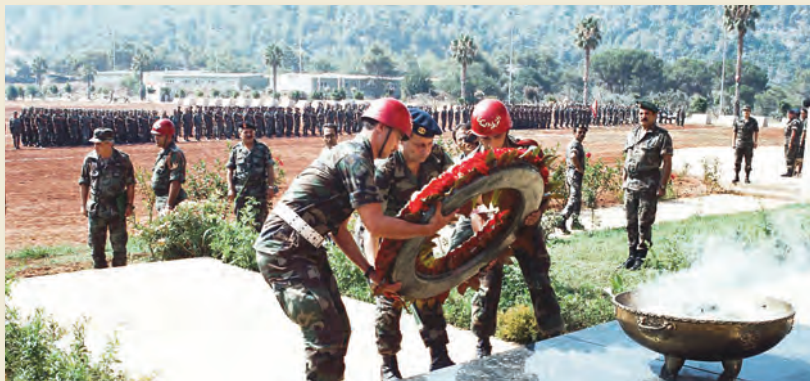
General Michel Aoun laying a wreath of flowers at the martyrs monument in 1986