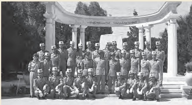
Commemorative photograph of the Military School Cadets on 28/8/1964