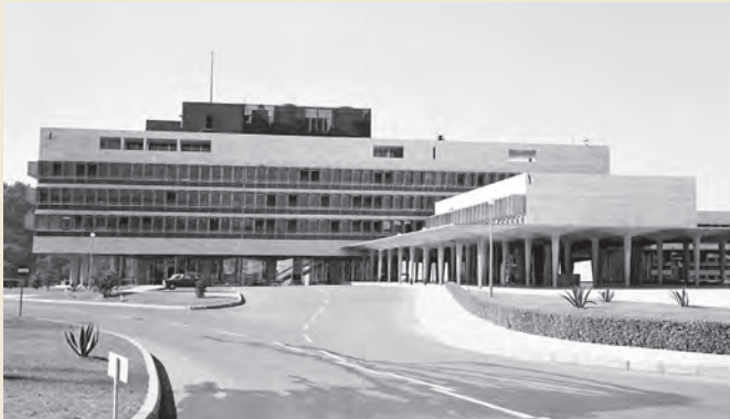
The Ministry of National Defense Headquarters in 1968