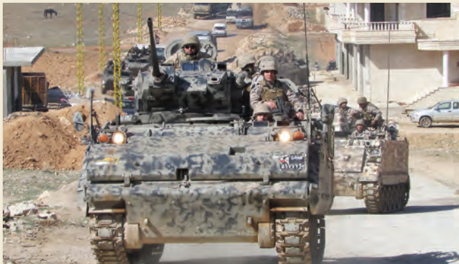
Ersal security incidents in 2014