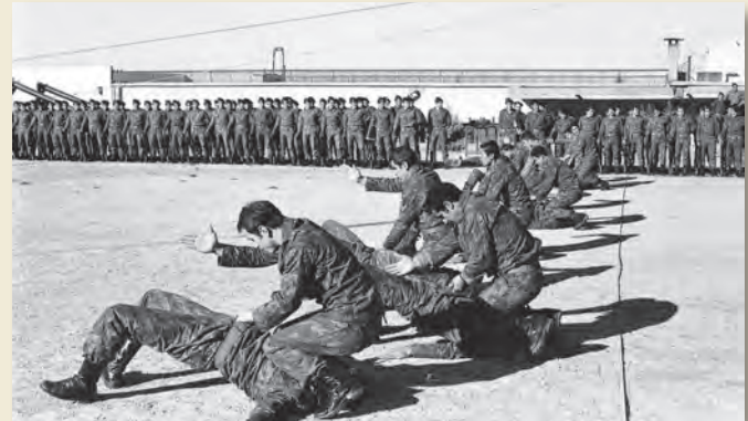
Graduation of a Commandos session in Hammana on 22/12/1973