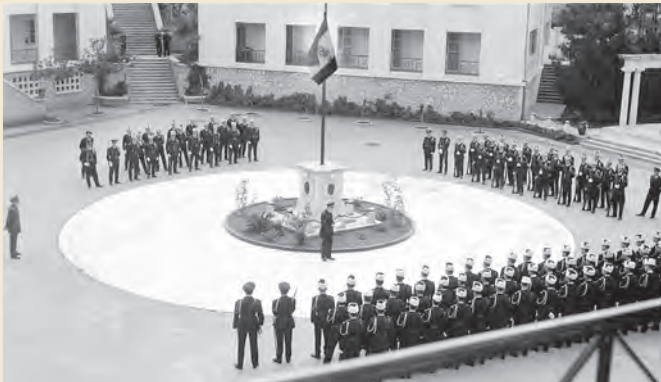
Ceremony of honoring the flag at the Military School on 4/12/1965