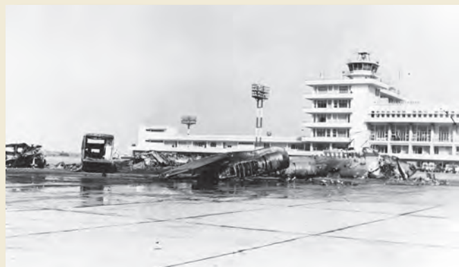
The Israeli aggression targeting Beirut airport on 29/12/1968