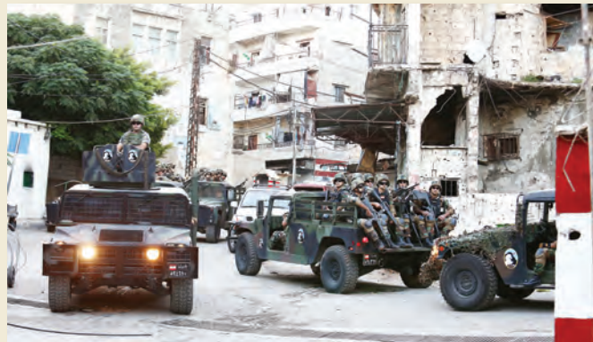
Tripoli security incidents in 2014