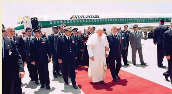
Welcoming the Pope on 10/05/1997