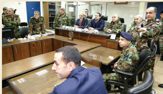
Prime Minister Saad el Hariri visiting the Operations Room on New Year's Eve in 2016