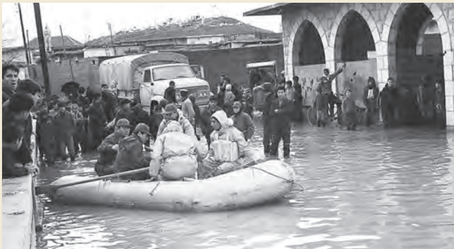
Rescue and evacuation operation of citizens stranded due to the floods in Barr Elias – the Bekaa in 1969