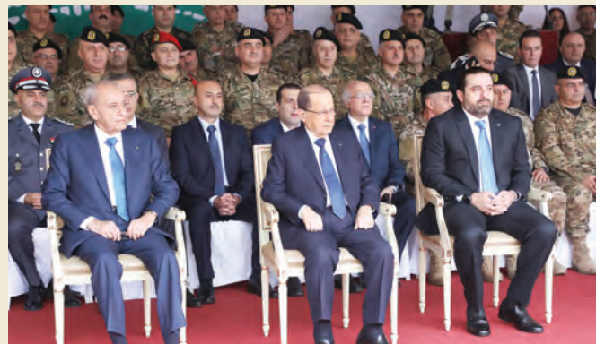
Unveiling the Independence monument during the 75 th Independence Day celebration in Yarzeh in 2018