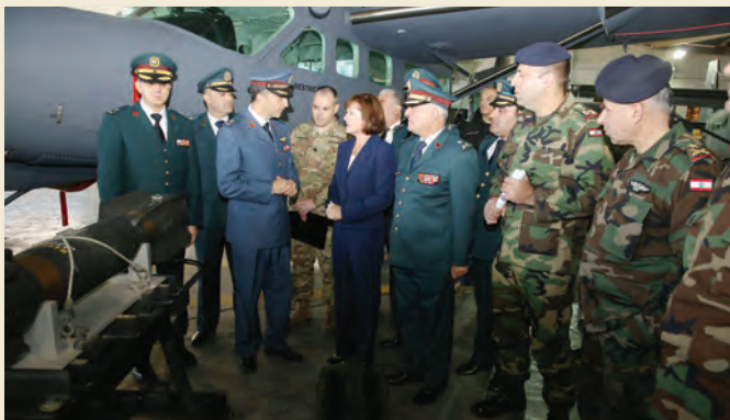
The handover of Cessna aircrafts in 2016