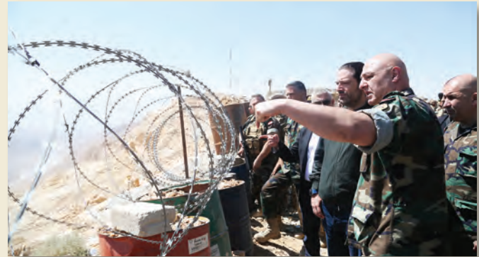
The tour of Prime Minister Saad el Hariri accompanied by General Joseph Aoun in Ersal in 2017