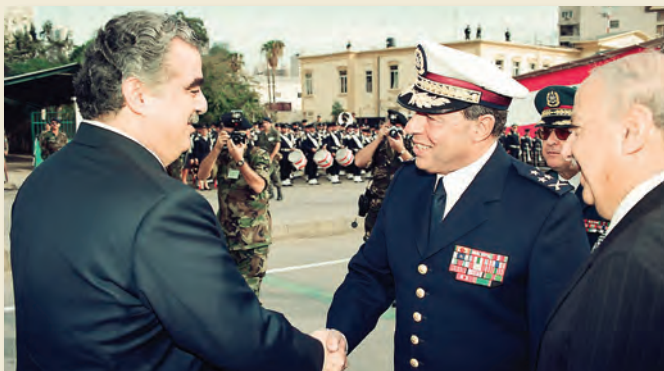
Independence Day 1997