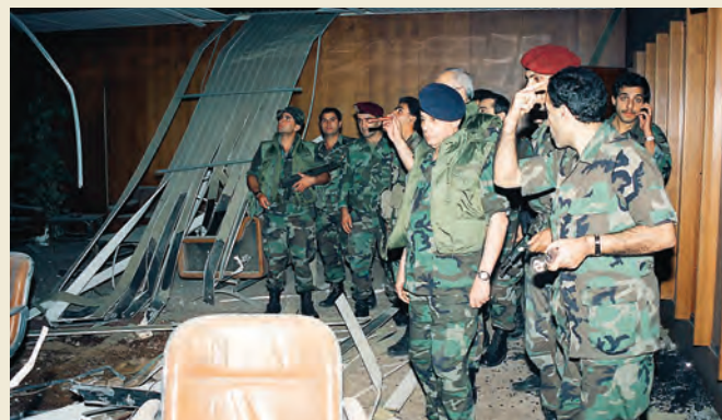
General Michel Aoun inspecting his office after being shelled in 1989