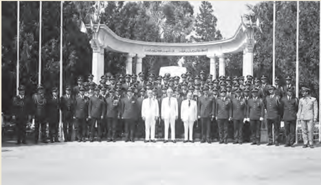
Army Day 1972