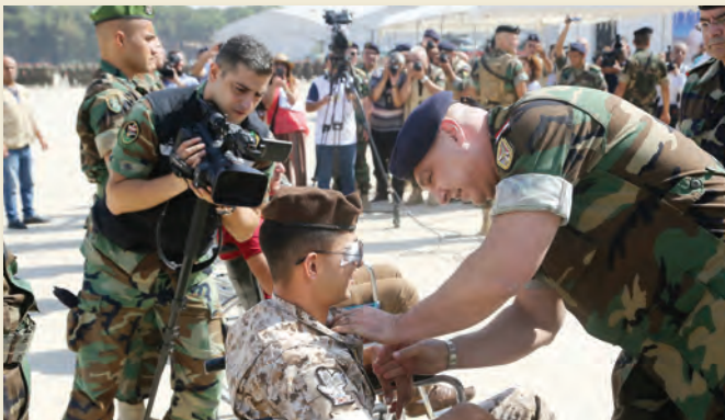
Honoring the units that were engaged in "Dawn of the Outskirts" battle on 16/09/2017