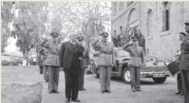
The President of the Lebanese Republic Sheikh Bechara el-Khoury in the inauguration of the Lebanese Troops Rest house on 24/11/1945