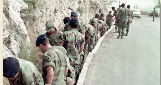
A cleaning campaign in Deir el-Qamar on 07/10/1994