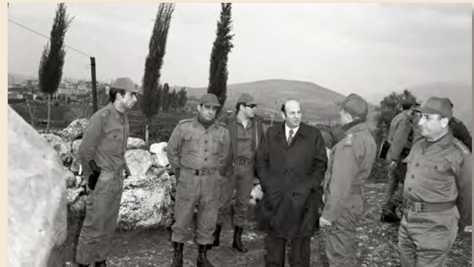
Visit of the Minister of National Defense Joseph Skaff and General Iskandar Ghanem to the southern border region on 20/2/1975