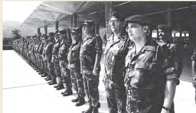
Army Day Celebration at the Ministry of National Defense in 1985