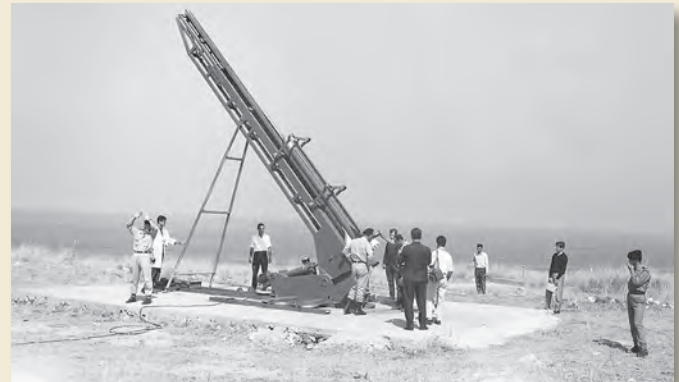
Testing the "Cedar" missile in 1965