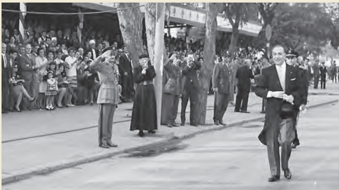
The President of the Lebanese Republic Fouad Chehab during the Independence Day celebrations in 1962