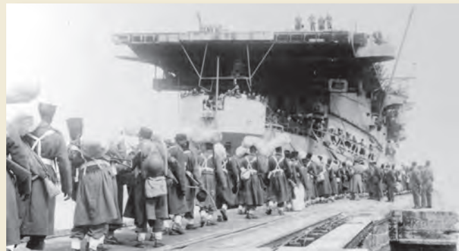
Evacuation of the first French unit from Lebanon on 24 March 1946