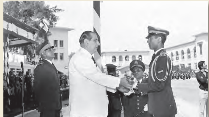
resident Charles Helou handing over the sword to a graduating officer on the Army Day 1968