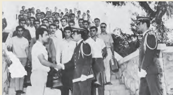
Arrival of new students to the Military School on 19/11/1964