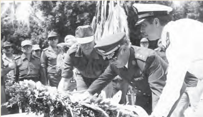
Laying a wreath of flowers at the Unknown Soldier monument in 1977