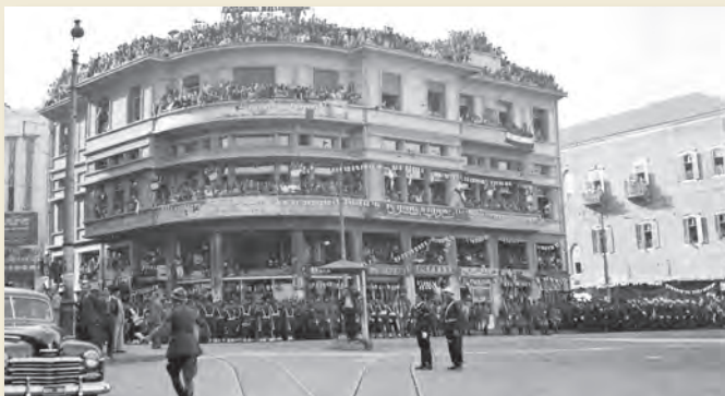
Celebrating the Martyrs Day at el-Burj Square in 6/5/1946