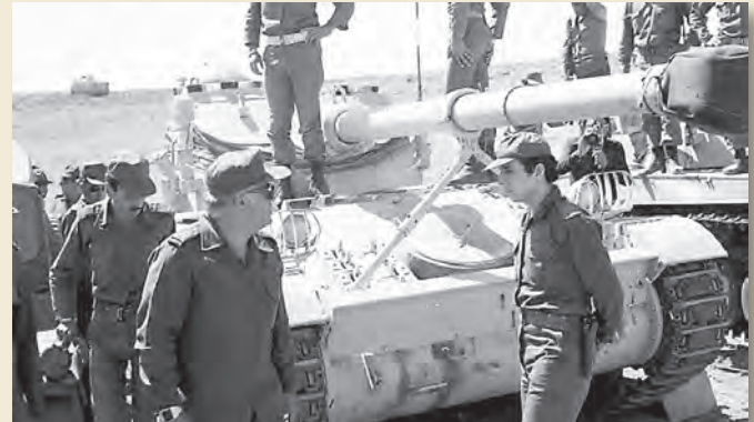
The visit of General Victor Khoury to Yammoune on 2/09/1978