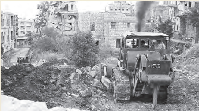
An Army vehicle contributing to rehabilitation works in the city of Alep on 7/11/1994