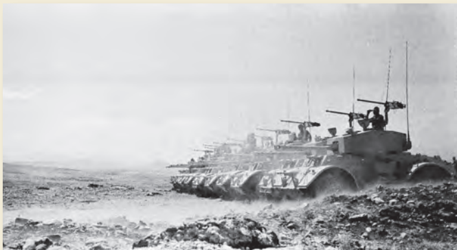
Armored vehicles during a shooting drill in Baalbek in 1970