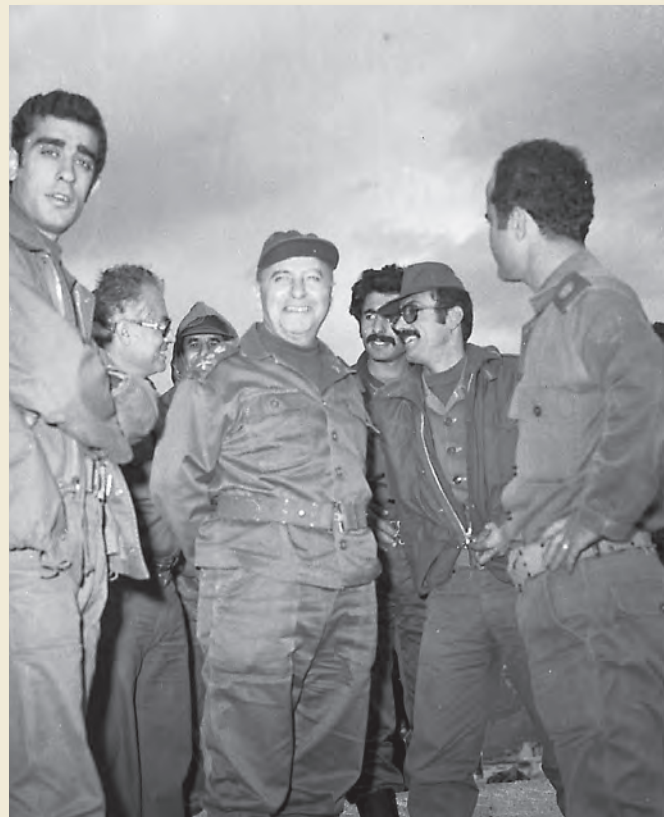
General Hanna Saiid visiting the troops in the region of Beirut on 03/11/1976