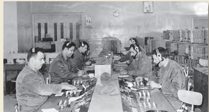
Strike of Phone operators and Army troops filling the gap on 29 December 1969