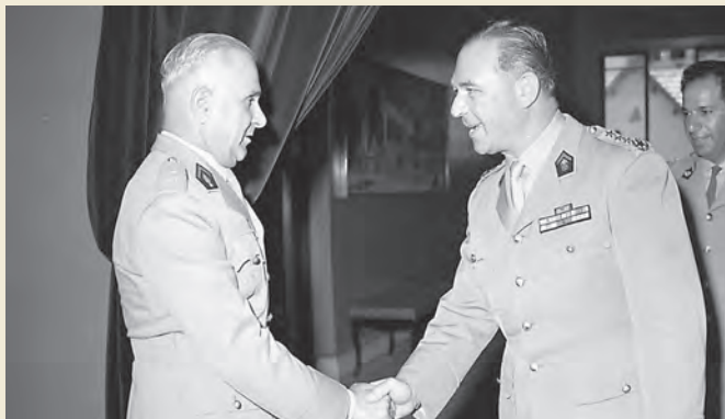
General Emile Boustany and General Jean Njeim congratulating one another on the Army Day in 1966