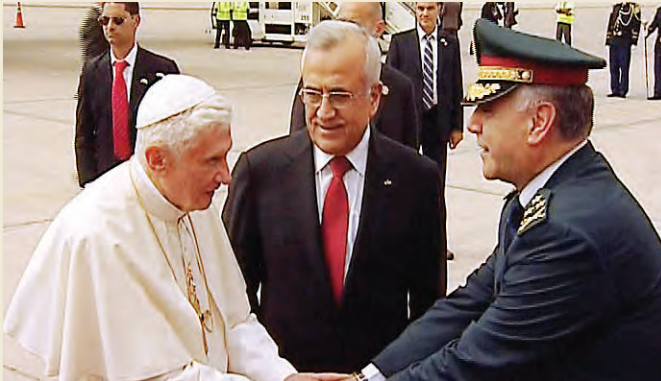
Welcoming the Pope on 13/09/2012