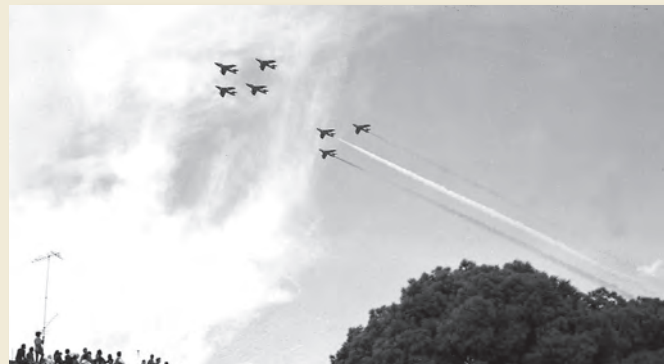
Air Parade during Independence Day celebrations in 1971