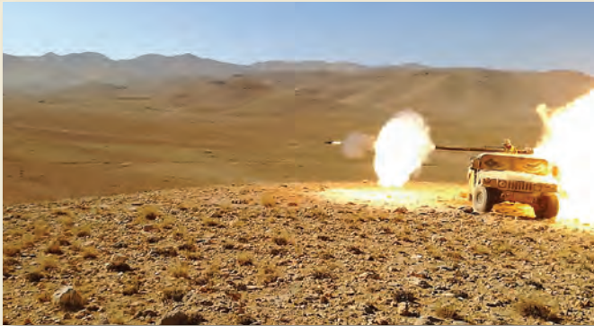
The Battle of "Dawn of the Outskirts" in 2017