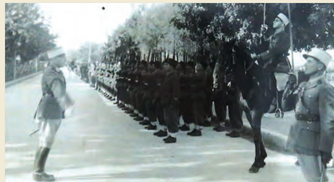
Exercises held for the military parade in 1943