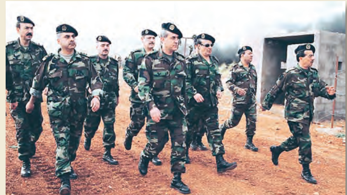
Tour of General Michel Sleiman in Bekaa on 13/04/2000