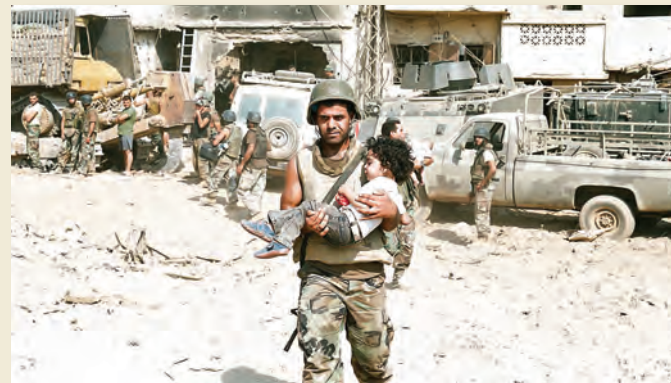
Evacuation of families of terrorists from Nahr el-Bared camp in August 2007