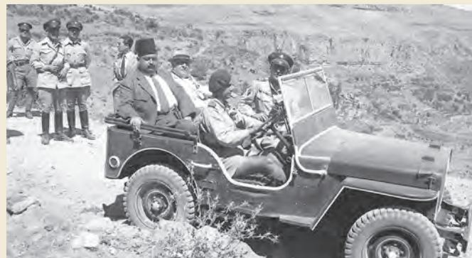
The President of the Lebanese Republic Sheikh Bechara el-Khoury and the Minister of National Defense Emir Majid Erislan attending an Army military drill on 3/8/1946