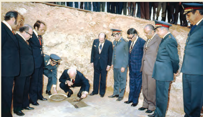
Laying the foundation stone of the Central Military Hospital in 1975