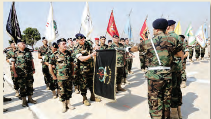
Awarding units that were engaged in "Dawn of the Outskirts" battle with the medals of war in 2017