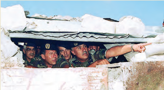
Tour of General Emile Lahoud in the South during the Israeli aggression in 1993