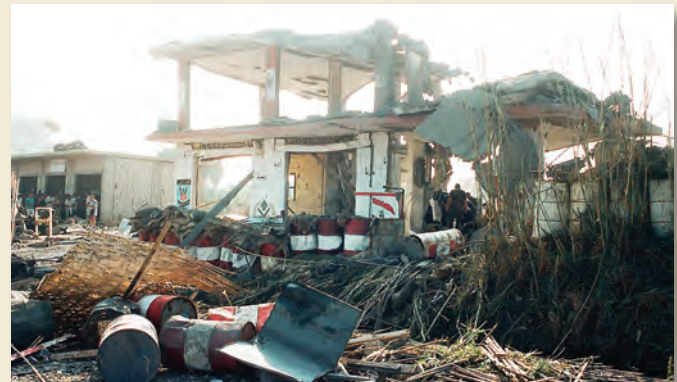
July assault in 2006