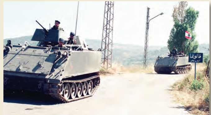
Deployment of the LAF in 1994