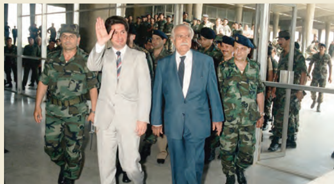
Visit of President Amine el-Gemayel to the Ministry of National Defense in 1984