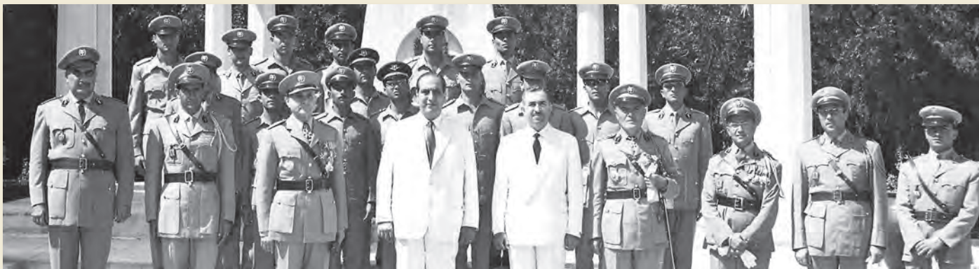
The President of the Republic Charles el-Helou and Prime Minister Rachid Karamé during the graduation ceremony of the "Honor and Loyalty" Class in 1965